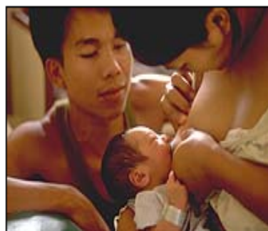
A father watches as his wife breastfeeds their new baby in the maternity ward of the Singburi Hospital, in the town of the same name. Fathers are encouraged to learn about the benefits and become active supporters of breastfeeding.

Since the BFHI began, more than 15,000 facilities in 134 countries have been awarded Baby-Friendly status. In many areas where hospitals have been